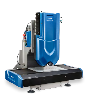
FocalSpec's 3D Line Confocal Scanner UULA

Oulu, Finland & Besançon, France: Finnish high-tech company FocalSpec, specialized in devices for fast surface measurement and on-line testing of challenging materials and shapes, and Digital Surf, global provider of Mountains<sup>®</sup> surface analysis software solutions, have teamed up to release FocalSpec Map , a cutting-edge software package bringing a whole new set of tools to users of the Finnish company's innovative Line Confocal Imaging (LCI) technology.